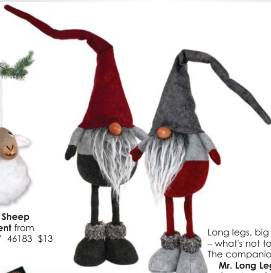
Red Hat 45732R Gray Hat 45732G

Long legs, big feet, roly-poly body – what's not to love? The companionable