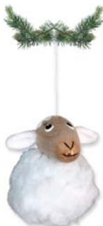
Woolly Sheep Ornament from Sweden. 2" 46183 $13