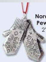
Norwegian Mittens Pewter Ornament 2" 6F254 $15